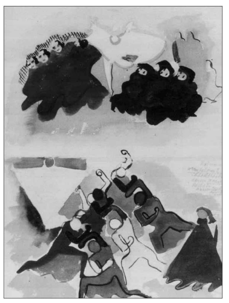
Friedl Dicker-Brandeis watercolor costumes design for Rosenbaumová.

Vera remembered one performance when they came to watch the show. The SS officers had removed their helmets and placed them on the edge of the little attic stage, the insignia of the Nazi skull and crossbones facing the stage and leering at Vera and the other children. Were the skull and crossbones a warning for what the SS officers would do to them after the show? It's all she could think about. Finally, the end of the performance came, the men took their helmets off the edge of the stage, put them back atop their heads and