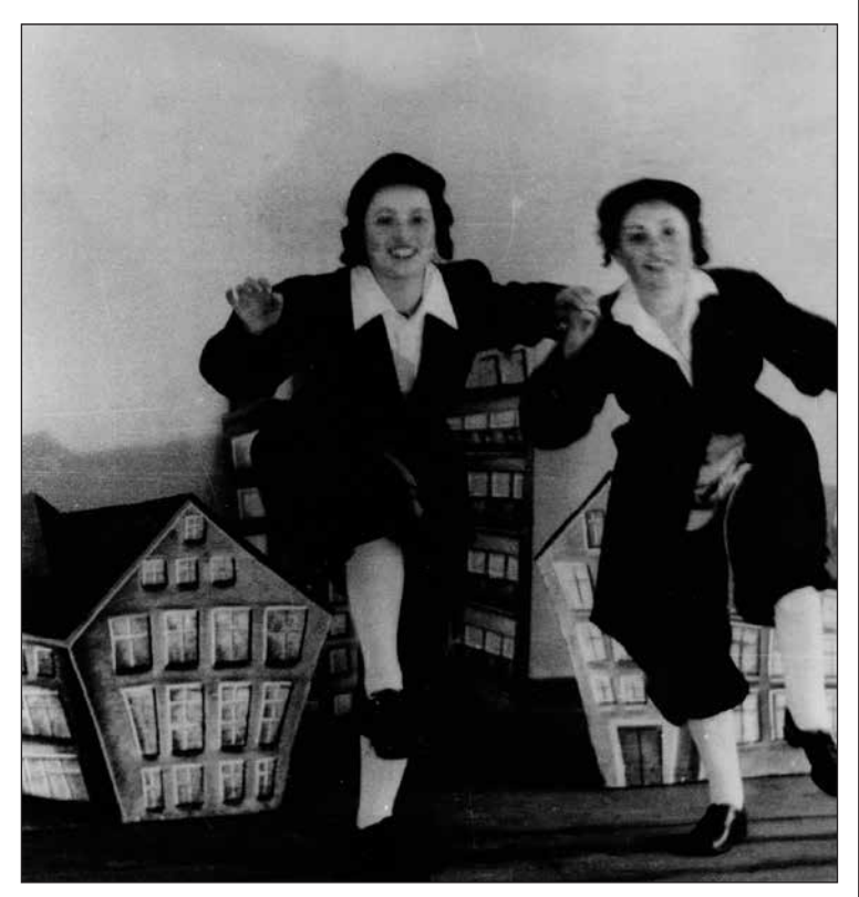
Zami Feder Bergen-Belzen production.

ductions in the Yad Vashem archives really caught my attention, two women dressed incongruously like Hasids, clearly dancing, kicking up their feet, in front of a city scape backdrop.