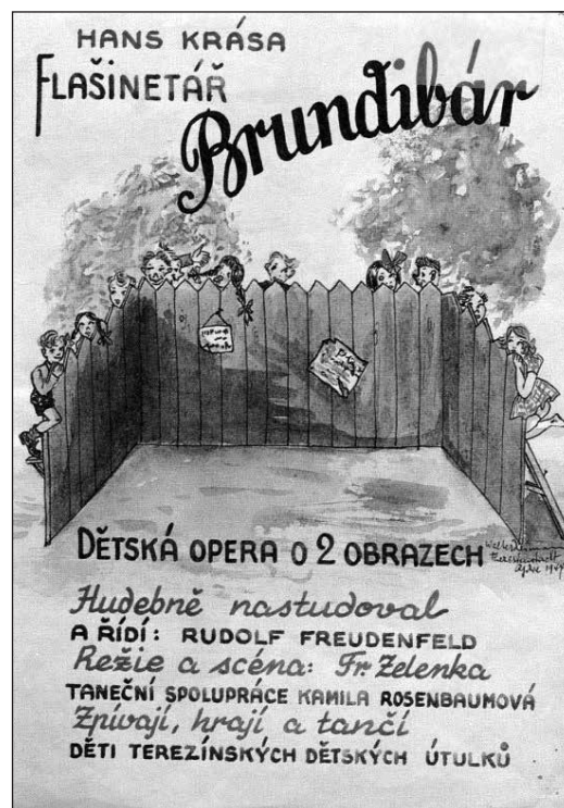
Poster of Brundibár

Probably the most well-known production advertised that we looked at was for Brundibár , the children’s opera in two acts. The ad featured a charming drawing of a three-sided wooden fence, as if it belonged in a children’s book. Children peered over the fence top, some of the girls in pigtails with bows, and one of the boys in his knickers at the edge of the fence. They were all focused on the space in the middle of the page surrounded by the fence with the list of names of all who were credited with the production. I immediately noted the choreography was by Rosenbaumová. Of all the poster ads in the archives, this is the only one I saw that is available on the internet. 11