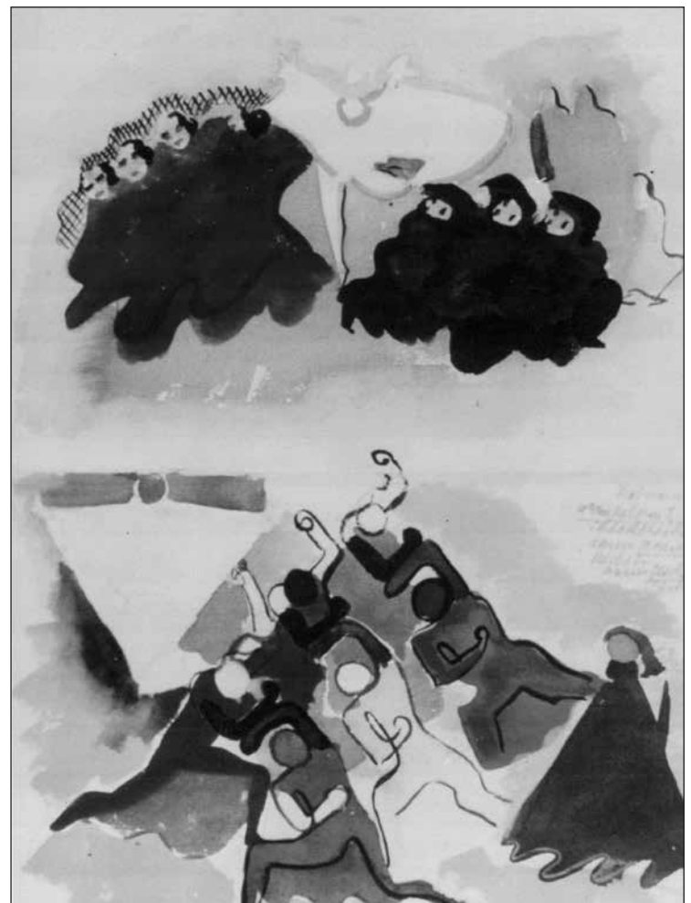
Friedl Dicker-Brandeis watercolor costumes design for Rosenbaumová.

Vera remembered one performance when they came to watch the show. The SS officers had removed their helmets and placed them on the edge of the little attic stage, the insignia of the Nazi skull and crossbones facing the stage and leering at Vera and the other children. Were the skull and crossbones a warning for what the SS officers would do to them after the show? It's all she could think about. Finally, the end of the performance came, the men took their helmets off the edge of the stage, put them back atop their heads and