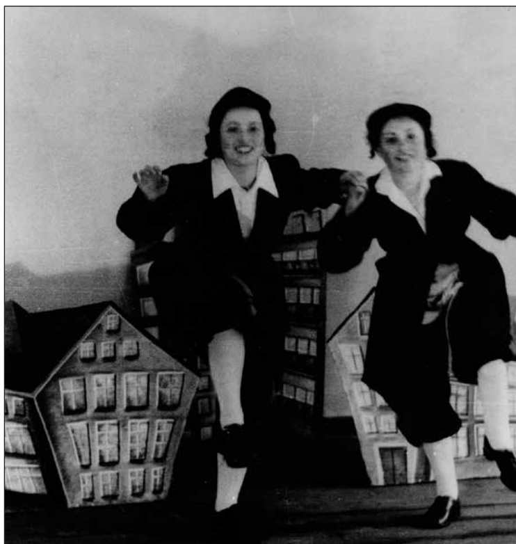
Zami Feder Bergen-Belzen production.

ductions in the Yad Vashem archives really caught my attention, two women dressed incongruously like Hasids, clearly dancing, kicking up their feet, in front of a city scape backdrop.